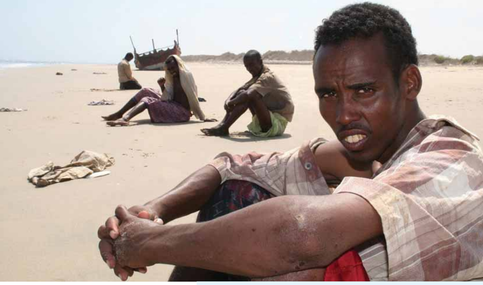
Exhausted survivors of the Gulf of Aden crossing, wait for help on a beach in Yemen. In 2012, around 100 deaths at the hands of people smugglers were recorded.