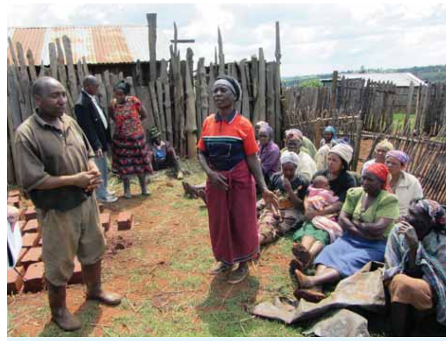
Conflict affected communities in Nakuru Country were brought together through NRC's Peace and reconciliation project.

NRC continued its work in the Rift Valley, providing homes for another 7,665 persons in 2012. The project was part of the government's