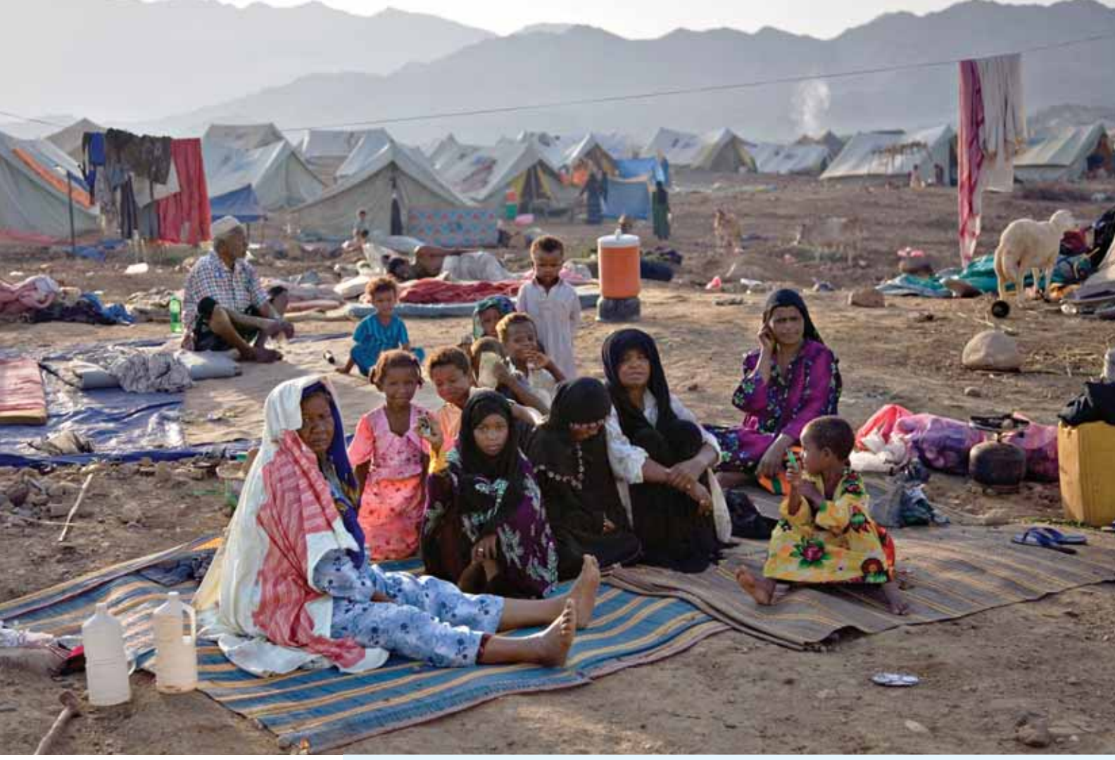
Displaced women in Yemen are some of the most marginalized people in the world.