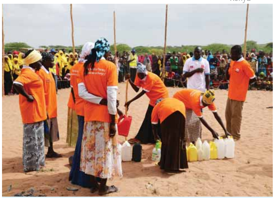
NRC and partners organised the marking of World Water Day in Dadaab 22 March 2012.

NRC constructed classrooms and spearheaded an assessment that highlighted the situation for the estimated 165,000 out-of-school children and youth in Dadaab. Through NRC's five Youth Education Centres (YEP), 727 students aged 15 to 24 received basic academic and vocational skills training. Graduates were supported to create cooperatives and were provided with tools for setting up small businesses, such as tailoring and mechanic repair shops. The businesses are located inside the camps, as refugees in Kenya are not allowed to work outside camps without special permission. 121 youth from the host community also received training in the joint refugee/host community YEP centre in Dadaab town. NRC trained teachers from the host and refugee communities. Nearly 1,000 former graduates attended follow up training, aiming at boosting