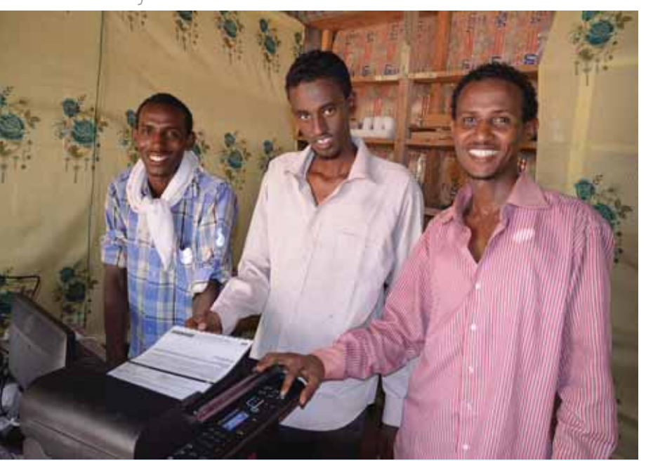
Young refugee men received training and support to start small cooperative businesses in the camps in Dadaab.

In March, NRC experienced a tragic loss when one of its incentive staff, a 21 year old Somali refugee, was shot and killed in a street shop. Aid workers were also targets for attack. In June 2012, a convoy of three NRC vehicles was attacked by gunmen in Ifo II camp.