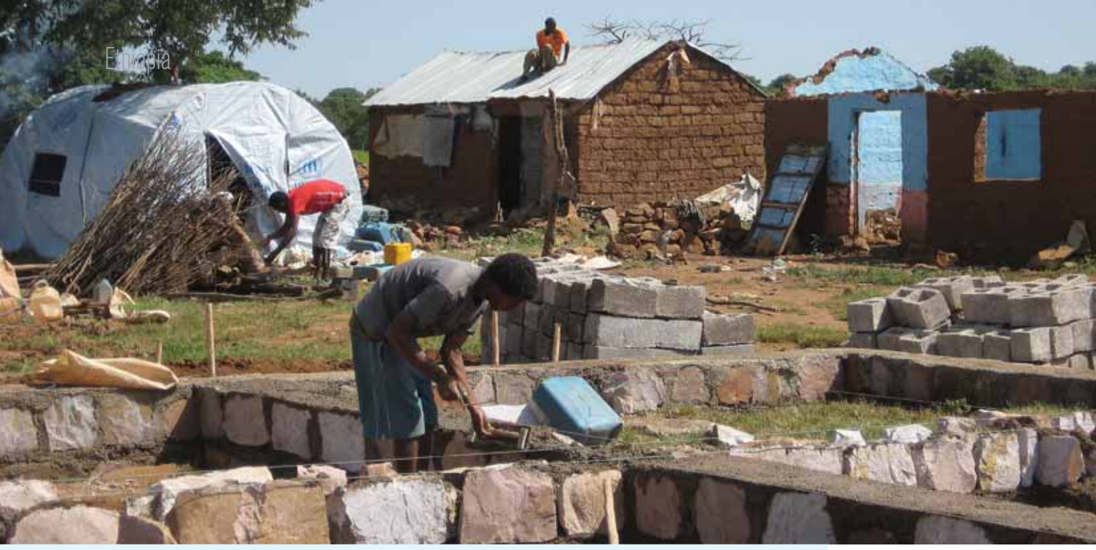
Before, May 2012: NRC erected tents for newcoming refugees in the Adi Haroush camp in Tigray region.

NRC opened offices in Shire in January and in Mai-Tsebri camp in March 2012, and took on the role as shelter sector lead. In Adi-Harush camp, there was an urgent lack of shelter. NRC adopted a community-construction approach and trained more than 500 refugees in making blocks, trusses, doors and windows. This provided meaningful work, skills