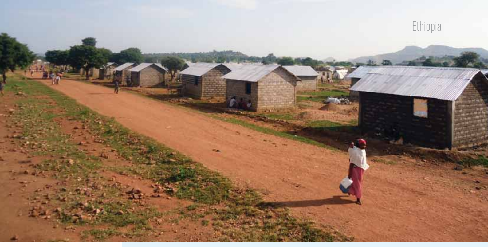
After December 2012, NRC had replaced the tents with 500 permanent homes for Eritrean refugees.

Associations, Association of People with Disabilities and NRC. The two committees agreed on selection criteria that were shared with the broader community through awareness raising meetings and by providing written information in the local language Tigrinya.