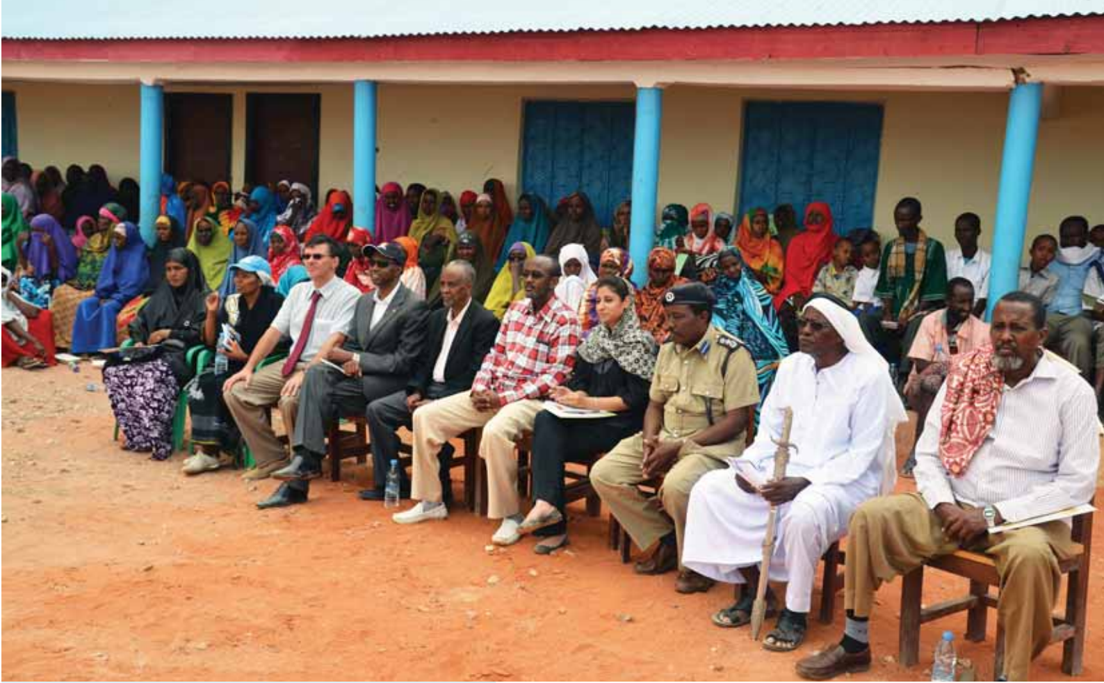
NRC works closely with the displaced communities, local authorities and organisations. A shelter handover ceremony in Puntland, Somalia in June 2012.

a total of 52 persons seconded to Ethiopia (10), Kenya (19), Somalia (13), and Yemen (10). In addition, NRC deployed three senior gender experts (GenCap) and two senior protection experts (ProCap) in Kenya, Yemen and Somalia. NRC is co-facilitating the Assessment Capacities Project (ACAPS) and seconded two experts to Kenya. NRC is engaged in NGO consortiums and is an active member of the Cash Learning Partnership (CaLP).