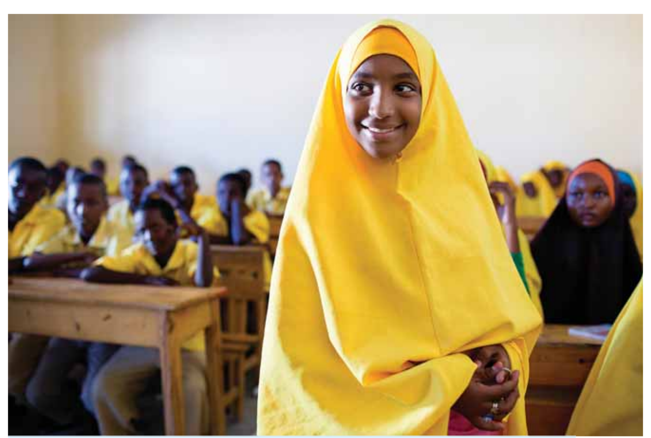
7,900 children in South Central Somalia gained access to education through NRC in 2012.

NRC supported 396,252 people in Somalia in 2012*