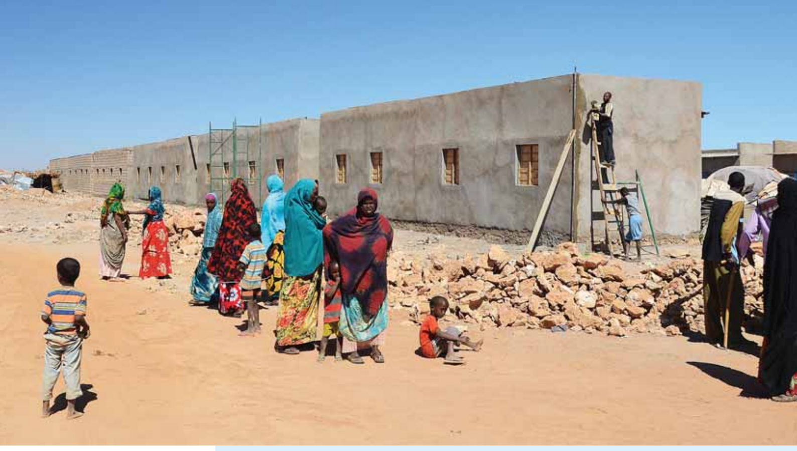
Displaced people in Burao, Somaliland were eagerly waiting to move into their new permanent homes constructed by NRC in collaboration with UNHCR and funded by the Government of Japan.

who were too old to enter the formal school system training in literacy, numeracy and life skills, as well as basic vocational training and support to set up small businesses.