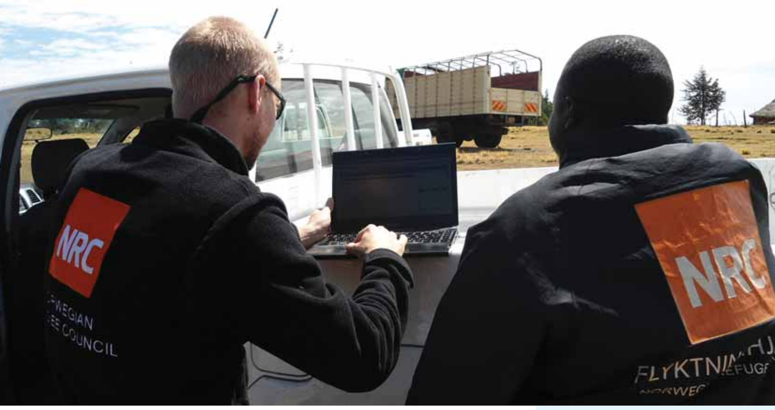
NRC's Monitoring and Evaluation team tested a pilot project using innovative mobile technology in Molo, Kenya.