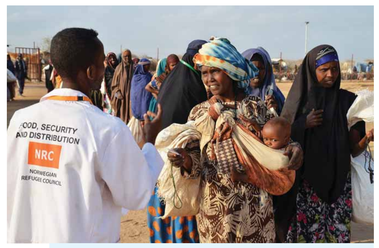
Women are in majority when picking up their bi-weekly food supplies at NRC's distribution point in Dadaab.

In 2012, 26,000 people came to Kenya, fleeing from South Sudan and Somalia. With new conflict hot spots and internal displacement, NRC stepped up its response in new areas.