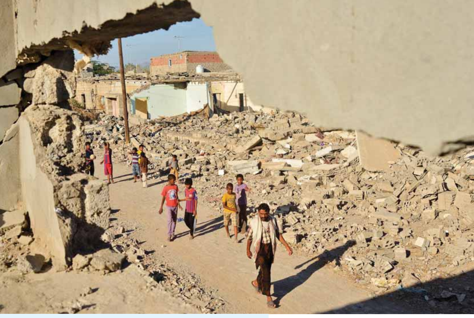
Armed conflict destroyed large parts of Zinjiber city in Abyan.

more than 80 schools were occupied in Aden alone, which in turn caused problems for the local children's access to education.