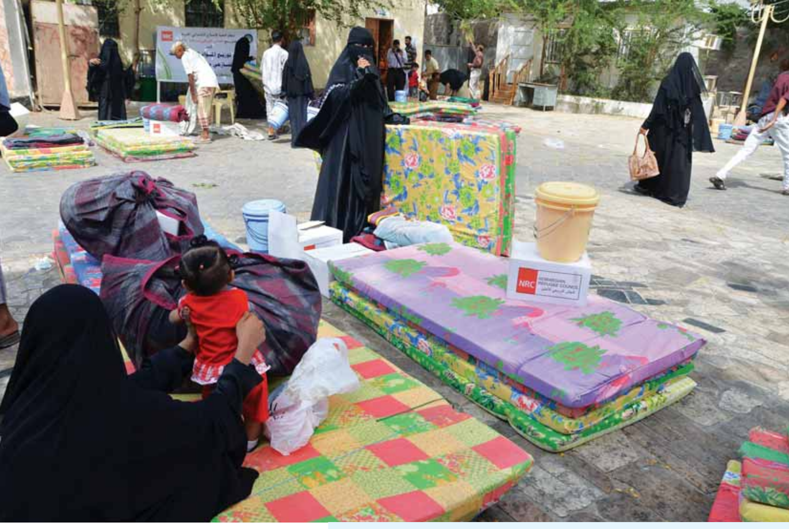
2,000 family emergency kits were distributed to displaced people in Aden.

assistance, NRC provided domestic latrines, sanitation and hygiene promotion activities. NRC also distributed 1,900 emergency supply kits to IDPs and vulnerable host community members.