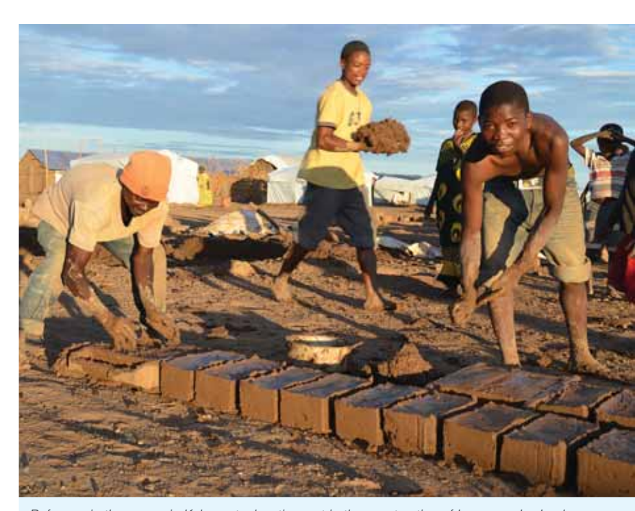
Refugees in the camps in Kakuma took active part in the construction of homes and schools.

NRC started its work in March, and quickly gained respect among the local communities through its swift action to provide latrines. By the end of the year NRC had provided 1,030 latrines, 200 sanitation kits and conducted 12 hygiene promotion campaigns targeting 32,000 refugees. NRC conducted a Knowledge, Attitude