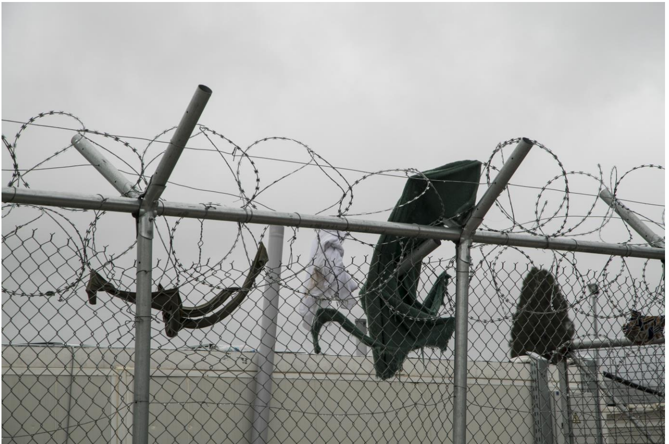
Barbed wire fences surrounding the refugee reception facilities on the islands.