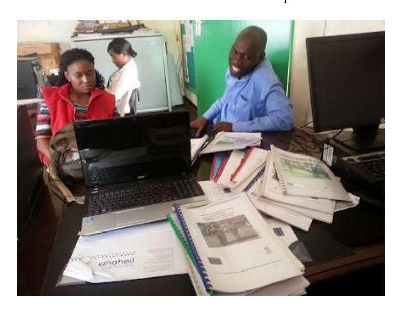
Figure 2: Copies of Ward Plans at the RDC in Chiredzi District